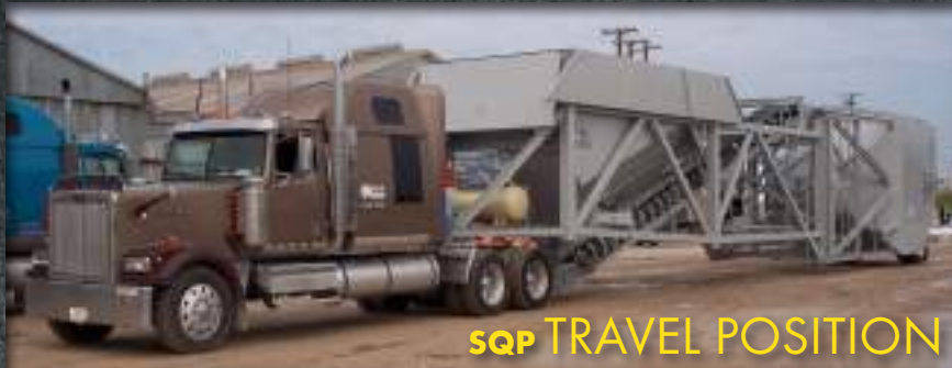
SQP TRAVEL POSITION